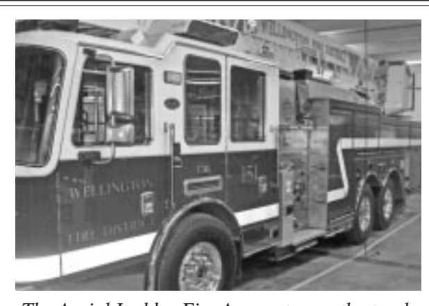
The Aerial Ladder Fire Apparatus on the truck.

To preserve our budgets for the next five years, the fireboard of trustees were able to secure a loan for $350,000.00 at 3.9% interest and pay for the balance of the expenditure from the operating budget. The loan will be paid back